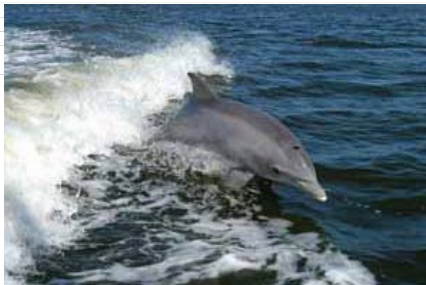
Dolphin

Scientists at the University of Southampton have developed a new kind of underwater sonar device that can detect objects through bubble clouds that would effectively blind standard sonar.