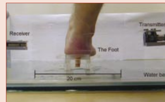
The experimental apparatus being used to test how ultrasound travels through bone.

"We are excited by the possibilities of using ultrasound to diagnose osteoporosis" Professor Tim Leighton